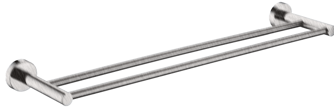
Elf Line 双毛巾杆 Covered screws Material: Metal